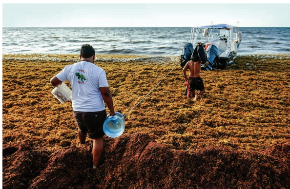
Sargassum seaweeds have washed up on an ocean beach in Playa del Carmen, Mexico, in May 2019.

sharp increase (a red edge) at a wavelength of ~700 nm. This allows imaging instruments with suitable spectral bands to discriminate between floating plant life and clouds, haze, foam, or reflected sunglint, which lack this red edge. However, patches of Sargassum are often much smaller than the spatial resolution (300 to 1000 m) of ocean-monitoring satellite imagers. The satellites therefore