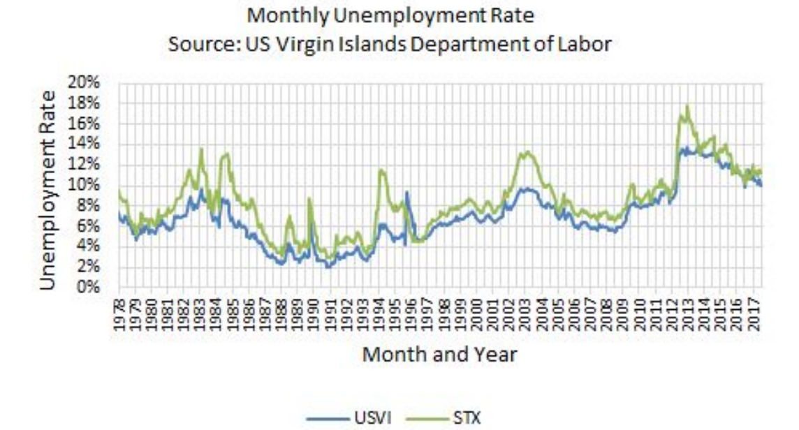
Figure 2. Rate of unemployment by month in the USVI and in St. Croix (STX).