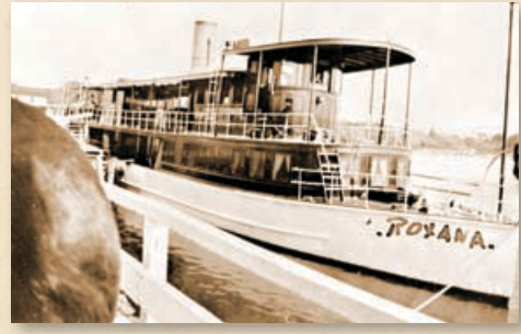
Steamboat Roxana on the Halifax River in 1908