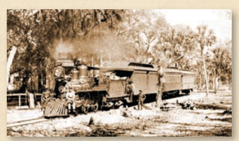
The first passenger cars to arrive in Daytona were pulled along the St. John's and Halifax River Railroad by engine #3 the "Bulow" in 1886.