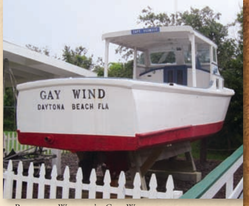
REDWOOD WHARTON'S GAY WIND IS PART OF THE MUSEUM'S COLLECTION

was strictly overseen by the Coast Guard. The Inlet was dynamited to create safer navigational conditions. Many of the fishing boat owners used their own craft to help patrol local waters and some went to work helping the war effort at the Daytona Boatworks.