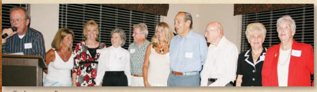
The Lighthouse Board before being presented with the volunteer service check