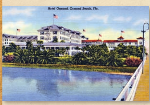
Completed in 1888, the Ormond Hotel paved the way for future resorts along the "World's Most Famous Beach"

Although real-estate development continued well into the 1920s, many investors grew increasingly concerned by the industry's continued reliance on credit. Unchecked land speculation over nearly three decades had resulted in over-inflated land values while loose lending practices created skyrocketing inflation. Alarmed by these trends, the Federal Reserve began to tighten its monetary policy. Loans were called in as credit dried up and people were unable to pay. These events, coupled with a devastating hurricane that struck south Florida in September, 1926, and the later collapse of the Stock Market in 1929, left many financial institutions and their investors bankrupt. The period known as the Florida Land Boom came to a