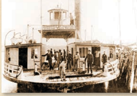
Ferrys were the only way to cross the Halifax River prior to the construction of the area's first bridge in 1889.

The explosive growth of agriculture, improved roadways, and tourism launched the Halifax and Indian River area into a new age of prosperity.