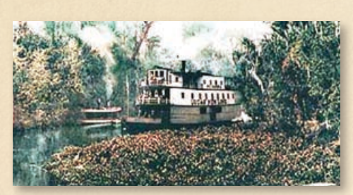
Steamships such as the paddle wheeler pictured here were the principle means of shipping goods to and from Volusia County prior to railroads.

The development of new transportation systems, including railroads and steamships, made the perishable fruit available throughout the northeastern United States. As demand for citrus increased across