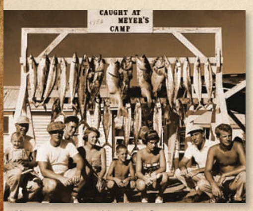
HAPPY ANGLERS AT THE MEYER FISH CAMP