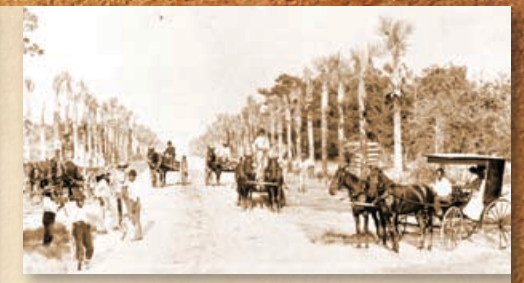
Once known as Ocean Blvd., Seabreaze Blvd. has changed considerably since this photo was taken in 1893.