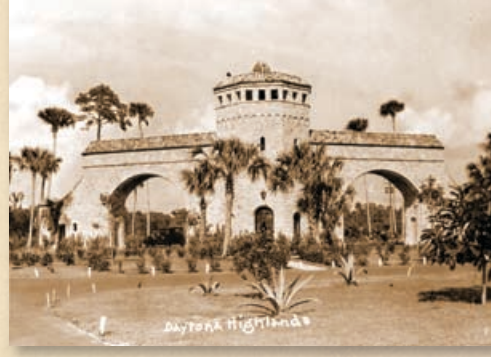
A portion of the old Terragona Arch that welcomed visitors to the Daytona Highlands Subdivision in 1925 can still be seen along International Speedway Blvd. today.