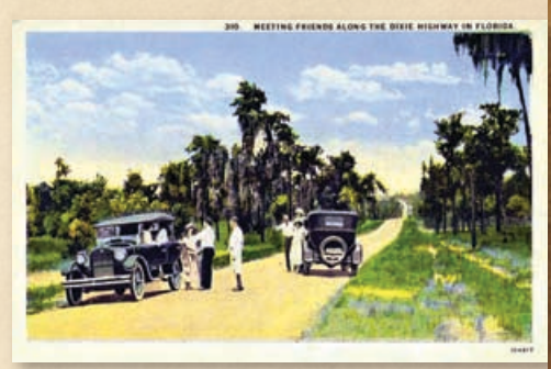
Roads like the Dixie Highway (USi) provided motorized access to the Halifax Region by the 1920s and 30s.