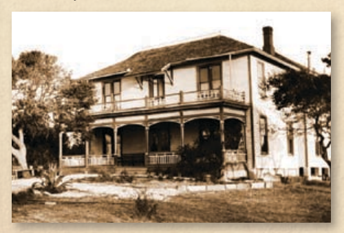
The Pacetti Hotel