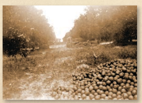
Oranges have been picked and are ready to be boxed and shipped in this 1920s photo of a grove in Volusia County.