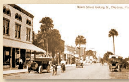
BEACH STREET IN DAYTONA AS IT APPEARED AT THE TURN OF THE CENTURY.