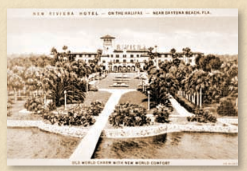
The Riviera Hotel in Holly Hill was one of several luxurious resorts built along the Halifax River and Atlantic coast during the early 1900s.