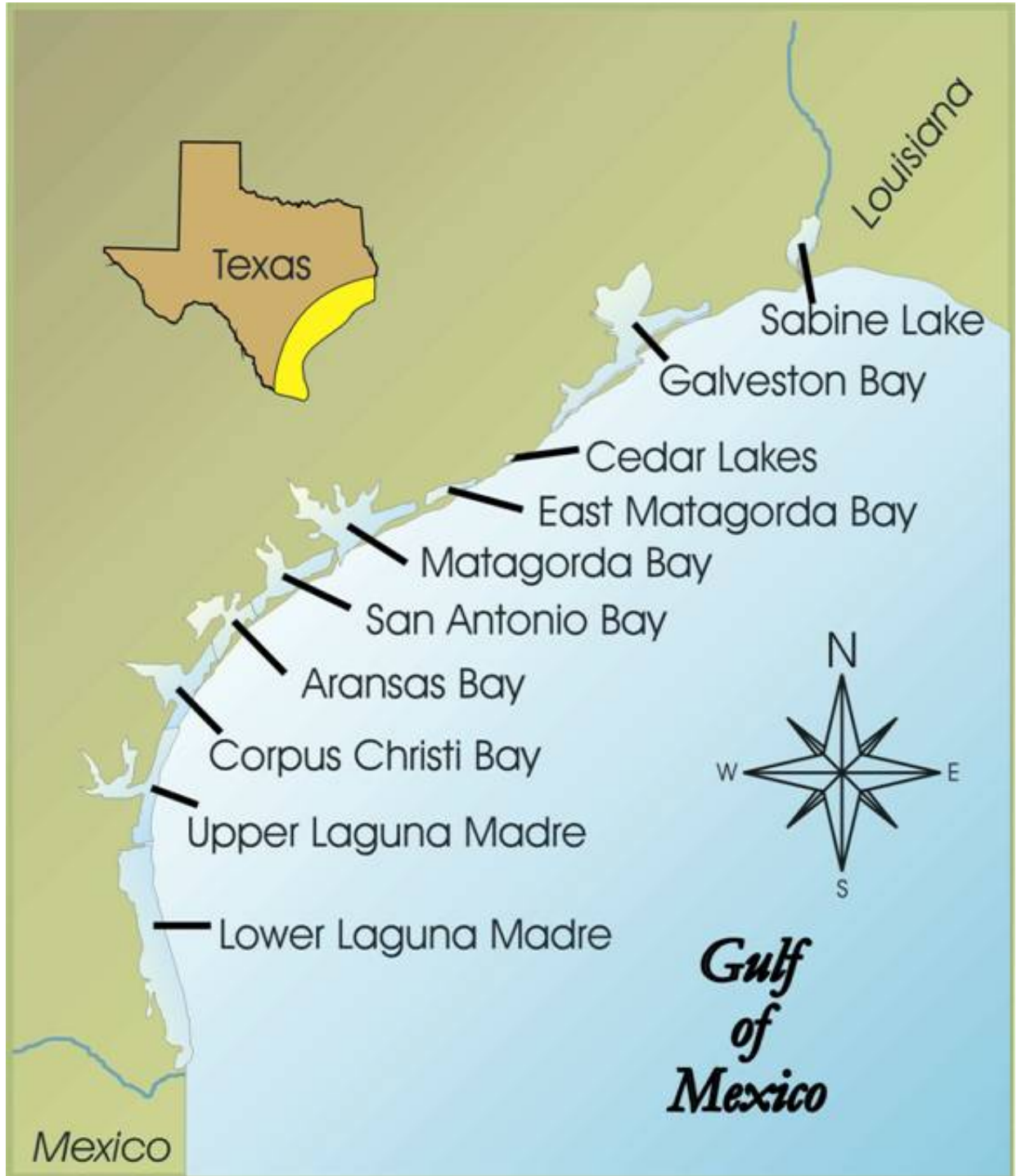
FIGURE 1.—Map of Texas bay systems.