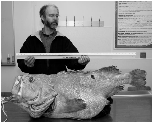
Figure 1. A big (1.1 m), old (ca.100 years), fat (27.2 kg), fecund female fish, in this case a shorttraker rockfish ( Sebastes borealis ) taken off Alaska (Karna McKinney, Alaska Fisheries Science Center, NOAA Fisheries Service).

Herein, we review the biological traits that vary with fish size and/or age and the implications of these traits for population resilience. We do not explicitly consider the economic benefits or costs of management strategies that preserve BOFFFFs. For many fisheries,